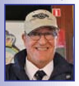
Dear IFFR friends,

A unique opportunity to get acquainted with the Belgian Ardennes in the company of your Rotary friends. The IFFR Benelux team has done everything to offer you and your crew a memorable weekend at the highest situated places in the south of Belgium where the gastronomy flourishes.